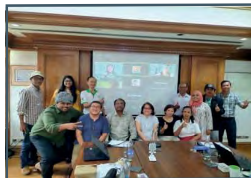
A group picture of the ACCC members at their 2023 Annual Meeting.

Dr. Rabbani's active participation and leadership role in these forums underscore the importance of collaborative action in addressing climate change on a global scale. As we approach COP 28, the groundwork laid by these discussions promise to contribute significantly to outline the future of climate adaptation efforts.