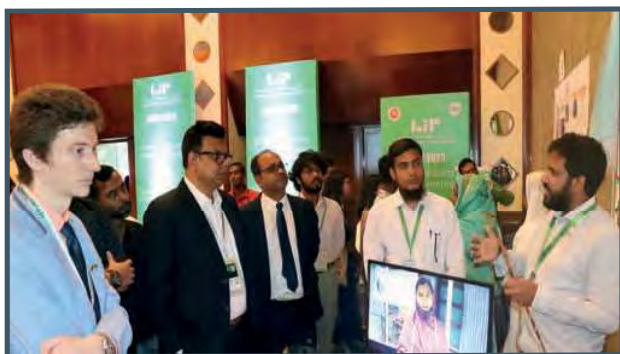
Panel and audience members engaging in IP presentations learning about their in-field operations under CBF.

Overall, this was an outstanding opportunity for the local level implementers to engage with national and international actors and vice versa.