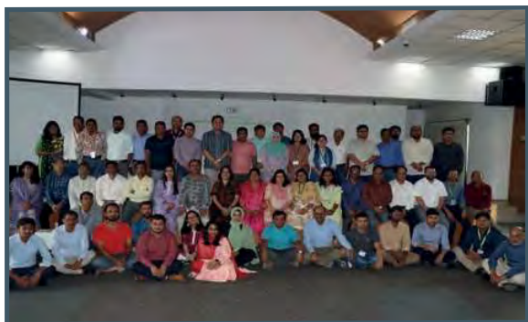
A group photo of representatives of CBF Secretariat and the Implementing Partners of ERW.