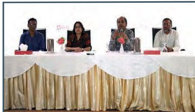
Guest speakers for the orientation session.

The key Objectives of the workshop were to: Enhance understanding of project operationalization procedures and skills to maintain the basic requirements of CBF's programmatic and technical compliances; Enhance knowledge on basic climate change concepts and adaptation measures; and Foster team building between CBF team and implementing partners (IPs).