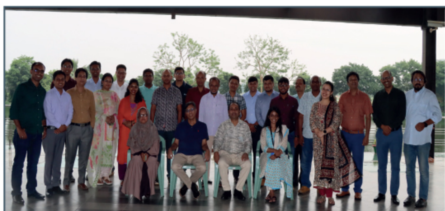
The participants and guests of the coordination meeting.