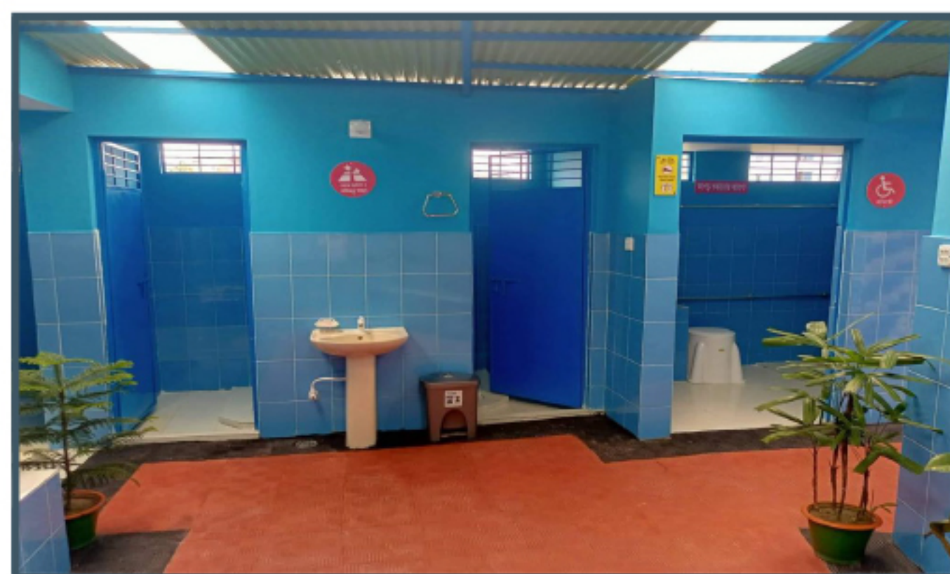
The school sanitation complex (outside view).