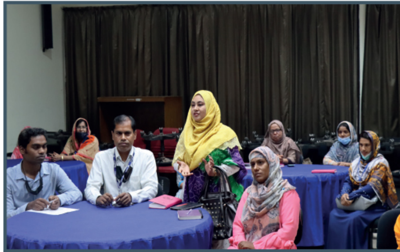
Project staff is sharing her work experience.