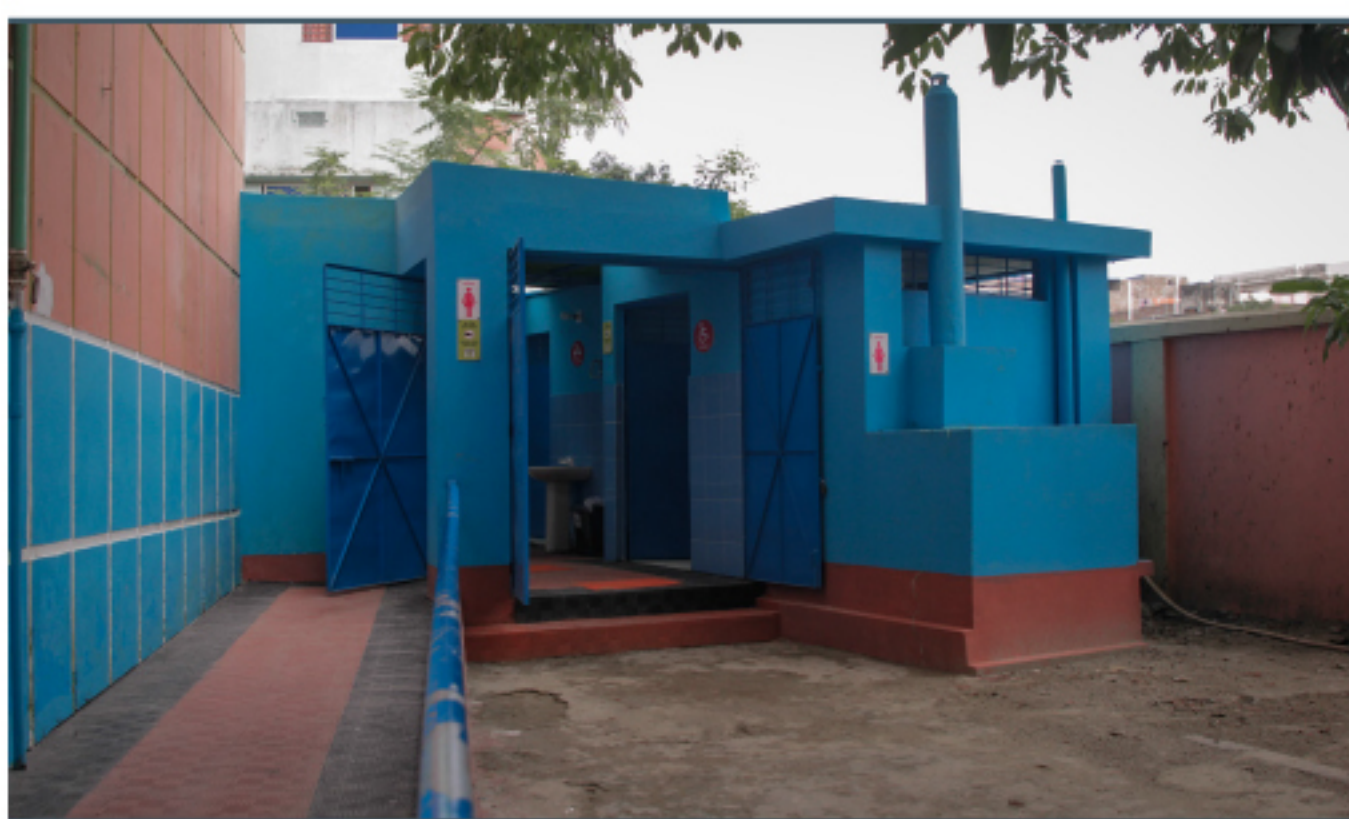
The school sanitation complex (inside view).

The complex consists of ten latrine chambers, with two compartments specifically designed for menstrual hygiene management. Additionally, hand washing facilities were also constructed. An incinerator has also been constructed to burn used sanitary napkins and to avoid long queues in front of toilets, sitting arrangements have been made. Outside the block, a drinking water station with water purifiers have been set up to ensure students' access to safe drinking water.