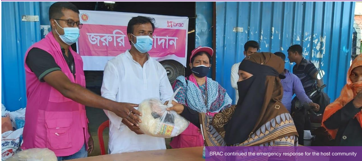
BRAC continued the emergency response for the host community