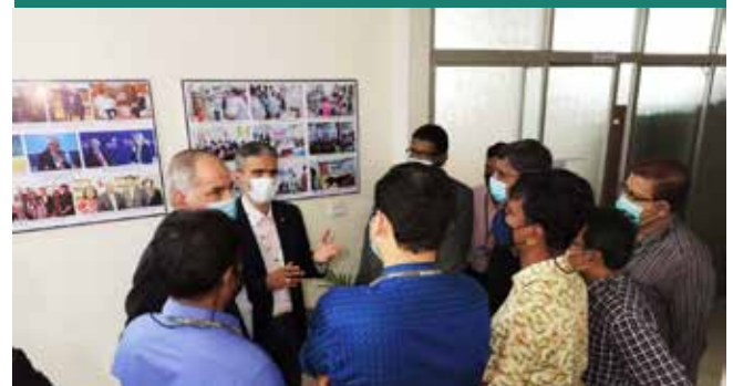
The KAAP team visiting the BRAC Urban Healthcare and Diagnostic Centre at Mohammadpur, Dhaka