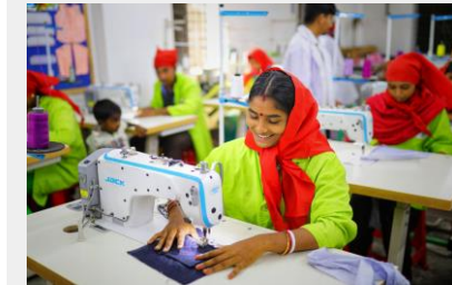
One-stop service centres to train the RMG workers