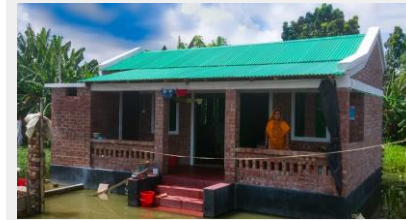
Low-cost climate resilient housing

Masud Ahmad masud.ad@brac.net +8801704121098